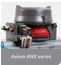
Axiom ANX series