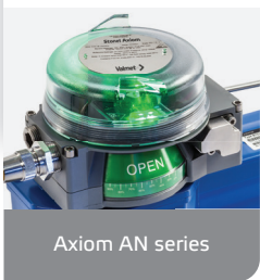
Axiom AN series