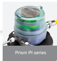
Prism PI series