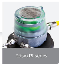
Prism PI series