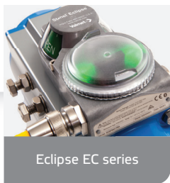
Eclipse EC series