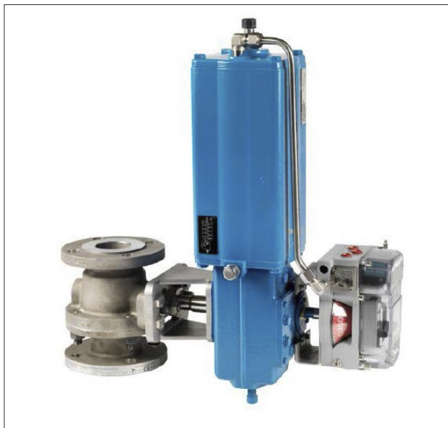
Neles ball valve

Neles ball valves are an optimal choice for POx applications. The valves incorporate robust stem-to-ball connection, which assures that the valves are delivering long-lasting performance in isolation and control applications. Application-based seat selection ensures that our valves are capable of delivering tightness even in the most demanding applications, including abrasive fluids and solids handling. Valve modularity widens the options in material selections, to meet the specific requirements of each POx process. Our valves meet and exceed modern industry requirements for reliability, performance and safety.